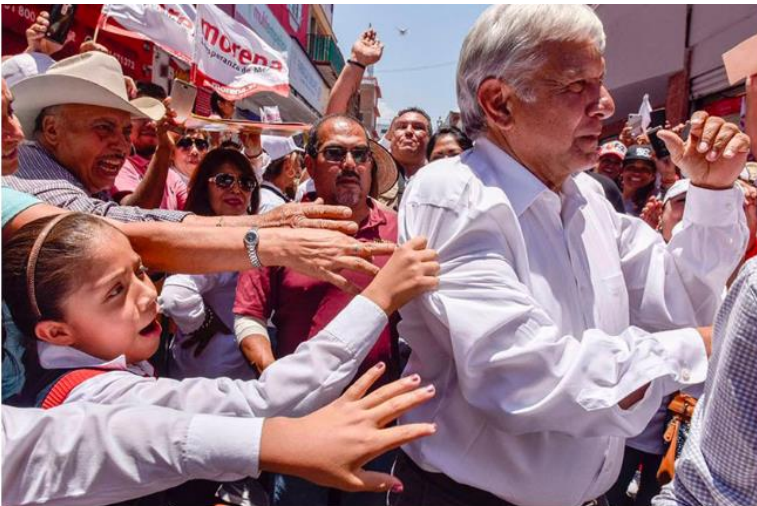
The president tours hospitals in Michoacán on the weekend.

Health, insecurity worrisome issues for AMLO; ending corruption is 'easy'